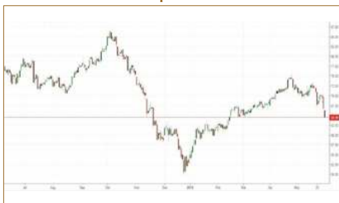
Brent crude price movement