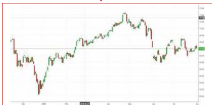
Brent crude price movement